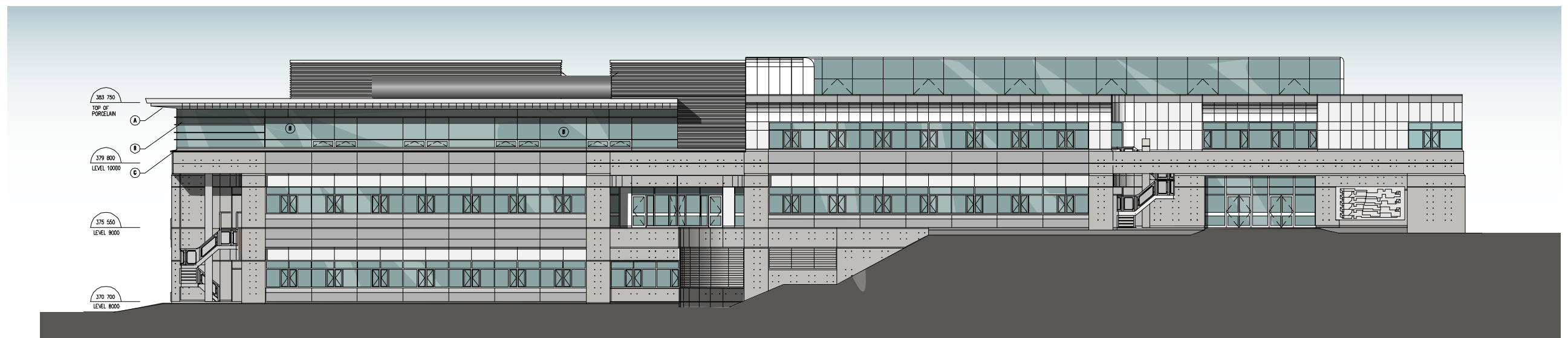
EAST ELEVATION 1:300