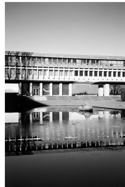
(Above) SFU in December 1999

Waterloo Maple Inc. http://www.maplesoft.com/